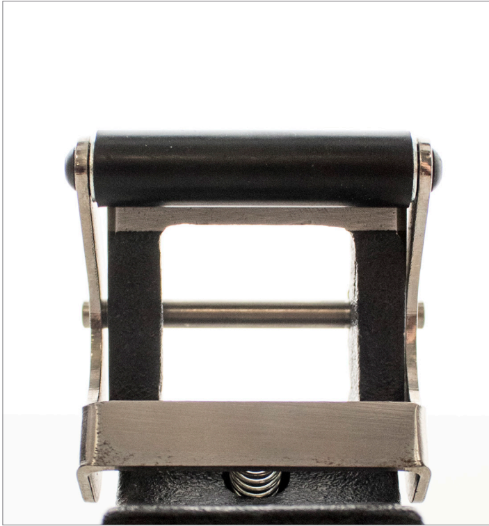
Rubber Coated Roller